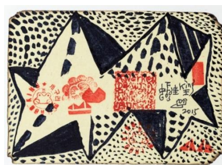
Caption: Frog King's Frog Fun Life Painting 3 displayed in Recent Works 2015 exhibition, 14.2 x 19.6 cm