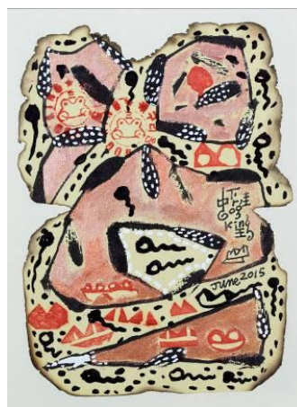
Caption: Frog King's Frog Fun Life Painting 1 displayed in Recent Works 2015 exhibition, 19.3 X 14.3 cm