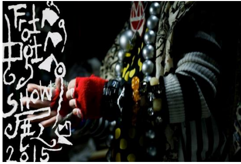
Caption: Frog King's Recent Works 2015 exhibition