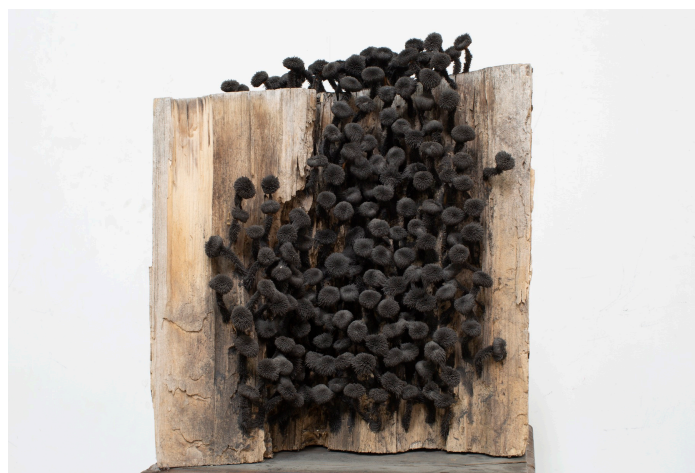
Untitled / 2015 / Iron dust, magnet, iron nail, wood / 53 x 45 x 35 cm