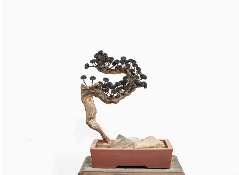
Bonsai / 2016 / Iron dust, magnet, iron nail, wood branch / 50 x 43 x 39 cm